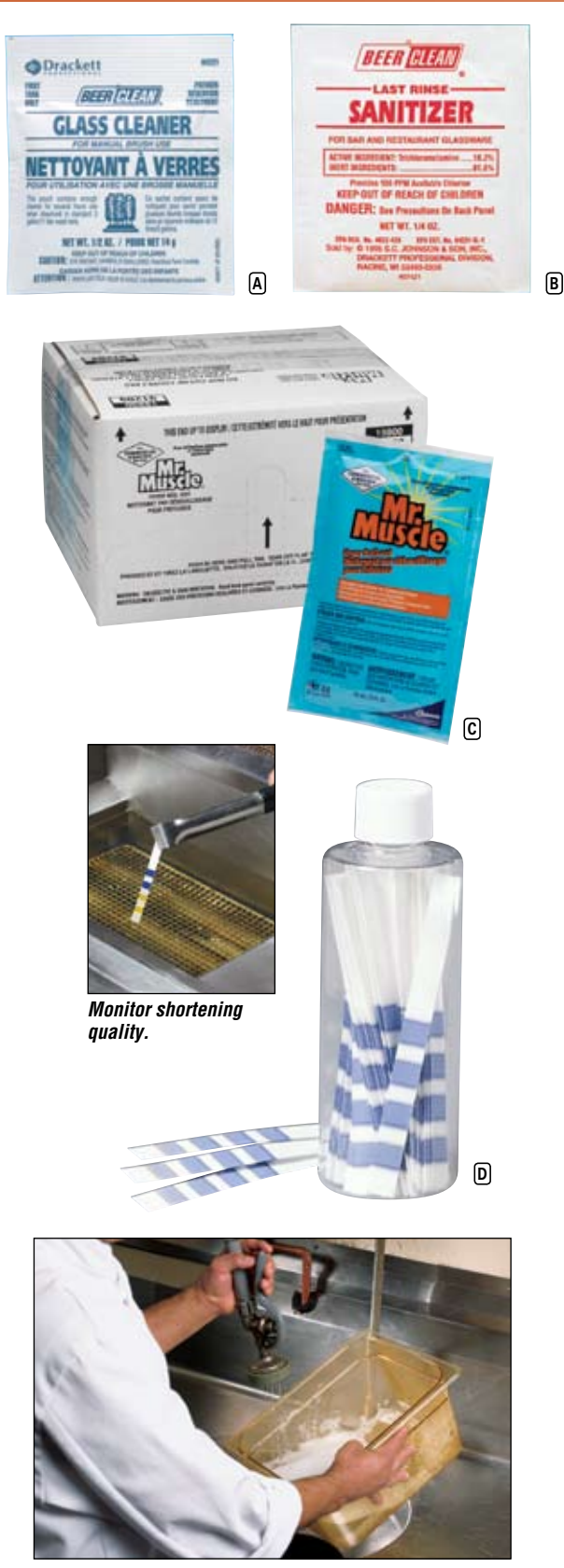
Proper cleaning and sanitizing protects everyone who comes into contact with the food you store, cook and serve.